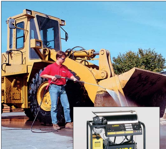
The SEHW is a top-of-the-line model for hot water pressure washing outdoors