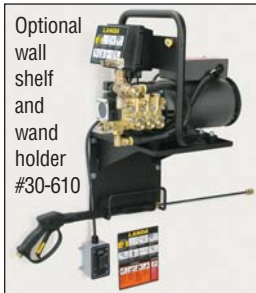
Optional wall shelf and wand holder #30-610

Landa's ZEF cold water pressure washer has a flexible design and industrial features that make it ideal for indoor use.